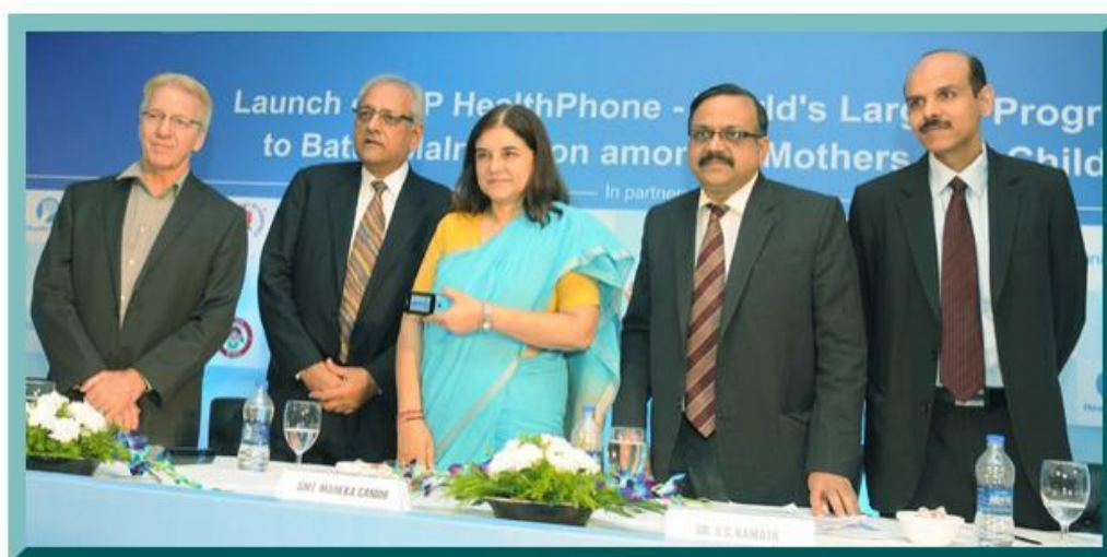
The Union Minister for Women and Child Development, Smt. Maneka Sanjay Gandhi launching the IAP-HealthPhone, in New Delhi on June 02, 2015.