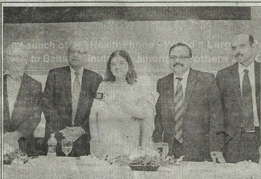
महिला एवं बाल विकास मंत्री मेनका गांधी ली मेरीडियन में आयोजित हेल्थफोन प्रोग्राम को लांच करती हुई।

जिसके जरिए देश में मोबाइल फोन्स के बढ़ते उपयोग का प्रभावी उपयोग किया जाता है, ताकि 13 वर्ष से 35 वर्ष तक की 6 मिलियन से अधिक महिलाओं व उनके परिवारों को बेहतर स्वास्थ्य एवं पोषण के तौर-तरीकों के बारे में वर्ष 2018 तक शिक्षित किया जा सके। इस प्रोग्राम के जरिए, एमडब्ल्यूसीडी और यूनिसेफ द्वारा भारत की 18 भाषाओं में संयुक्त रूप से तैयार किये गये पोषण सीरीज के चार पुनर्संपादित वीडियोज का व्यापक रूप से प्रचार-प्रसार एवं वितरण किया जायेगा और इस प्रकार, इस प्रोग्राम का लक्ष्य हासिल किया जायेगा। पोषण वीडियोज में महिलाओं की स्थिति, गर्भवती महिलाओं और दो वर्ष से कम उम्र के बच्चों की देखभाल, दुग्धपान और संतुलित पोषण एवं स्वास्थ्य के महत्व तथा आहार में छोटे-मोटे परिवर्तन कर पोषण के स्तर में भारी वृद्धि करने के उपायों के बारे में जानकारी दी है। प्रोग्राम को शुरू करने को, आईएपी ने इन चारों वीडियोज को अधिक से अधिक लोगों को दिखलाने के लिए वोडाफोन इंडिया के साथ अनूठी साझेदारी की है।