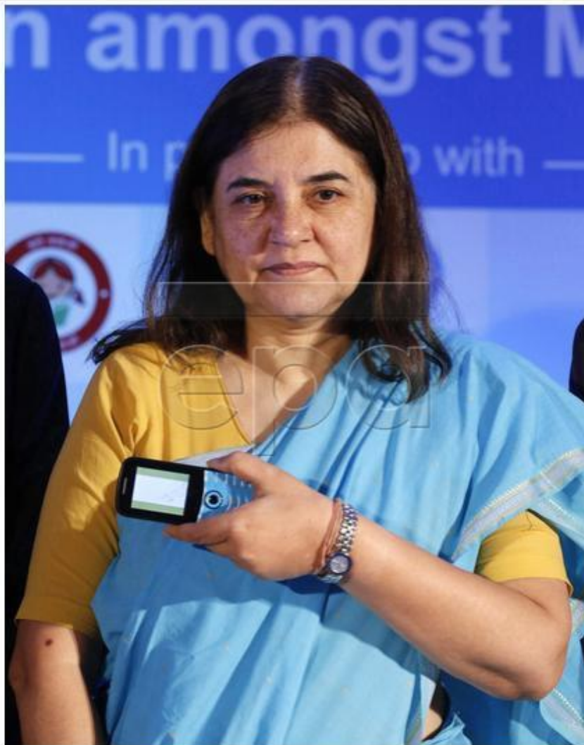
Malnutrition health-phone photo information