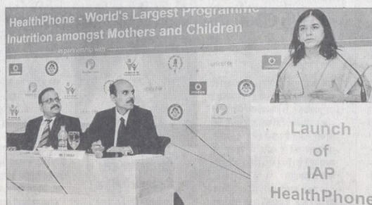
कार्यक्रम में विचार व्यक्त करती महिला एवं बाल विकास मंत्री मेनका गांधी।

नई दिल्ली (एजेंसी)। स्वास्थ्य एवं पोषण से जुड़े महत्वपूर्ण विषय पर ग्रामीण महिलाओं तक मोबाइल फोन के जरिये पहुंच बनाने की पहल के तहत महिला एवं बाल विकास मंत्रालय और युनिसेफ ने एक कार्यक्रम शुरू किया है जिसके तहत चार ज्ञानवर्द्धक वीडियो भेजे जायेंगे और इन्हें देखने वाली महिलाओं को प्रोत्साहन राशि भी दी जाएगी। महिला एवं बाल विकास मंत्री मेनका गांधी ने इस डिजिटल शिक्षा कार्यक्रम को पेश किया जिसके तहत साल 2018 तक 2.5 करोड़ महिलाओं को शिक्षित किया जाएगा और इसके तहत 18 विभिन्न भाषाओं में वीडियो भेजे जाएंगे। इस कार्यक्रम को मंत्रालय, इंडियन एंक्टमी आफ पेंडिंगट्रिक्स, युनिसेफ, हेल्थ प्रोग्राम और वोडाफोन के सहयोग से तैयार किया गया है। इस वीडियो को केवल वोडाफोन के उपभोक्ताओं को नि:शुल्क भेजा जाएगा और इन चारों वीडियो को डाउनलोड करने वालों को 10 रुपये