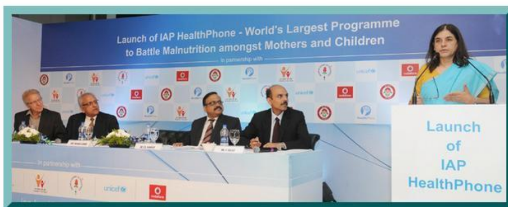
The Union Minister for Women and Child Development, Smt. Maneka Sanjay Gandhi addressing at the launch of the IAP-HealthPhone, in New Delhi on June 02, 2015. CNR :68795 Photo ID :66119