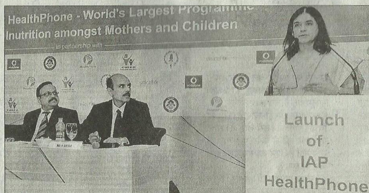
कार्यक्रम में विचार व्यक्त करती महिला एवं बाल विकास मंत्री मेनका गांधी।

नई दिल्ली (एजेंसी)। स्वास्थ्य एवं पोषण से जुड़े महत्वपूर्ण विषय पर ग्रामीण महिलाओं तक मोबाइल फोन के जरिये पहुंच बनाने की पहल के तहत महिला एवं बाल विकास मंत्रालय और यूनिसेफ ने एक कार्यक्रम शुरू किया है जिसके तहत चार ज्ञानवर्द्धक वीडियो भेजे जायेंगे और इन्हें देखने वाली महिलाओं को प्रोत्साहन राशि भी दी जाएगी। महिला एवं बाल विकास मंत्री मेनका गांधी ने इस डिजिटल शिक्षा कार्यक्रम को पेश किया जिसके तहत साल 2018 तक 2.5 करोड़ महिलाओं को शिक्षित किया जाएगा और इसके तहत 18 विभिन्न भाषाओं में वीडियो भेजे जाएंगे। इस कार्यक्रम को मंत्रालय, इंडियन एकेडमी आफ पेंडियाट्रिक्स, यूनिसेफ, हेल्थ प्रोग्राम और वोडाफोन के सहयोग से तैयार किया गया है। इस वीडियो को केवल वोडाफोन के उपभोक्ताओं को निःशुल्क भेजा जाएगा और इन चारों वीडियो को डाउनलोड करने वाले को 10 रुपए