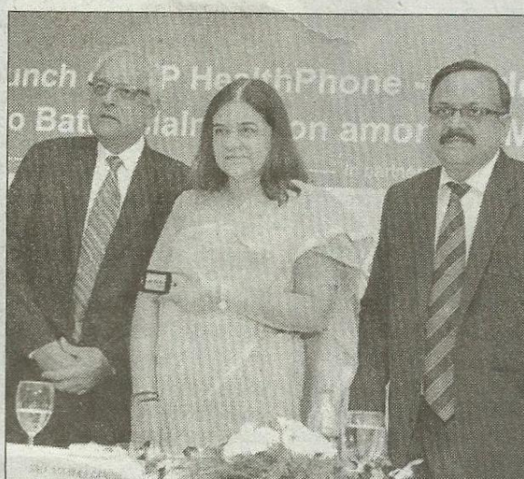
इंडिया पीडियाट्रिक्स एकेडमी के सहयोग से ‘आईएपी हेल्थफोन’ कार्यक्रम में मेनका गांधी।

उन्होंने कहा कि ग्रामीण भारत में कुपोषण के खिलाफ डिजिटल तकनीक का इस्तेमाल अपने आप में अनोखा है। इस कार्यक्रम में वीडियो के जरिए लोगों को कुपोषण से बचाव की जानकारी दी जाती है। उन्होंने कहा कि कुपोषण का एक प्रमुख कारण जानकारी का अभाव है